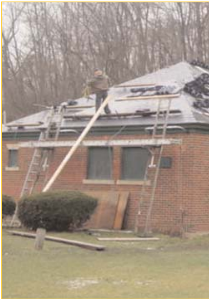
Elyria Parks and Recreation Department

In 2002–2003, the Foundation funded 13 projects for a total of $146,320.