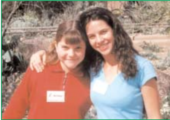
Big Brothers Big Sisters of Tucson