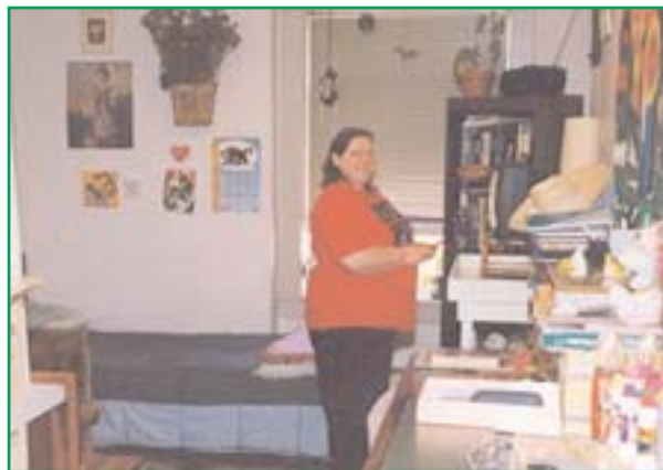
Downtown Emergency Service Center

To support the Juvenile Diversion Mediation Program in Lorain County, a year-round program for at-risk children and adolescents