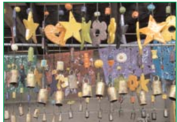
Ben's Bells, Tu Nidito Children and Family Services

Continued support of the Lorain County Project providing sports and recreational activities for children with physical challenges