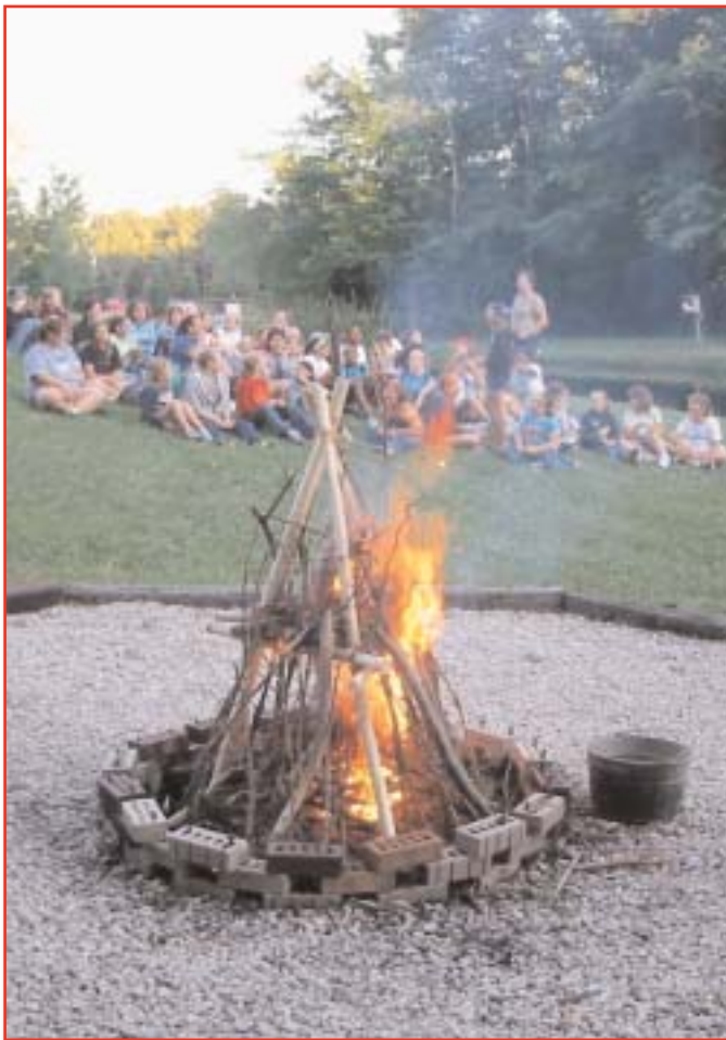
Girl Scouts of Erie Shores

In 2002–2003, the Foundation funded 14 projects for a total of $362,500.