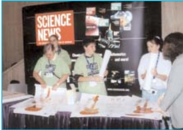
Cleveland 2003 International Science & Engineering Fair