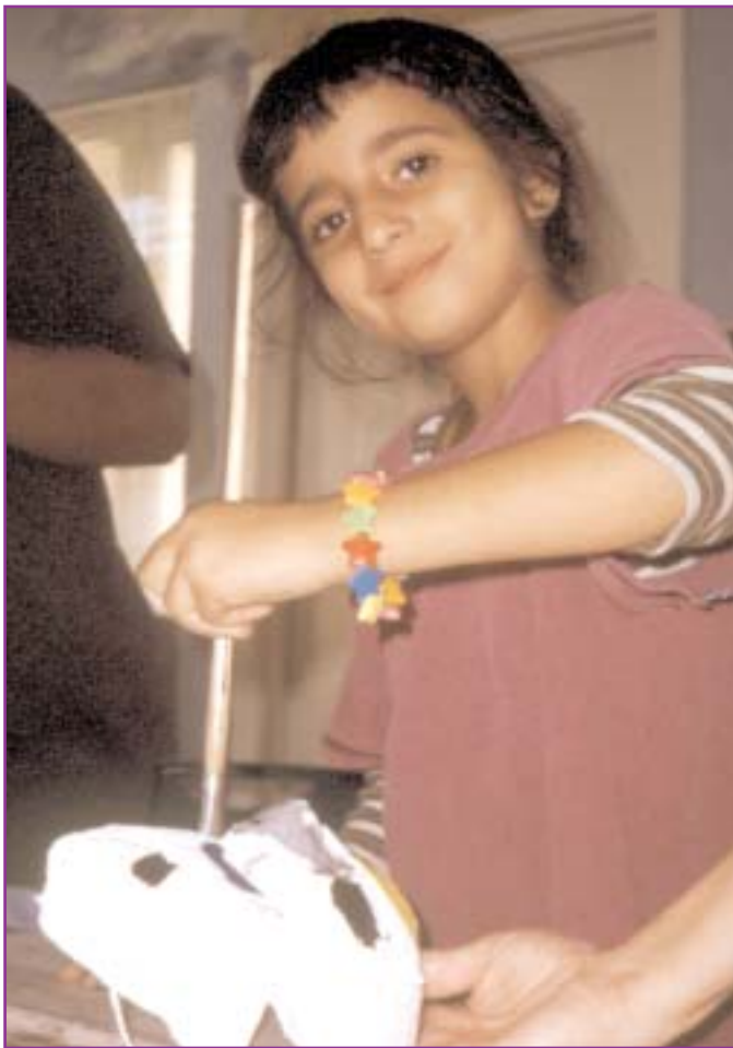
The Art Room

In 2002–2003, the Foundation funded 25 projects for a total of $201,000.