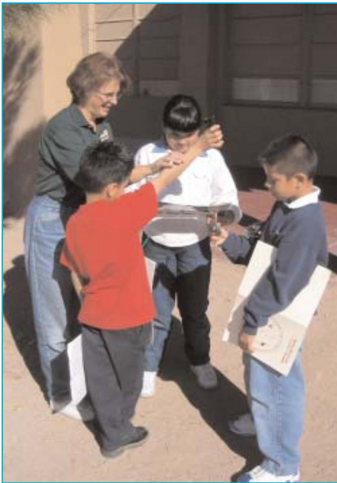
Chihuahuan Desert Nature Park

In 2002–2003, the Foundation funded 37 projects for a total of $229,550.