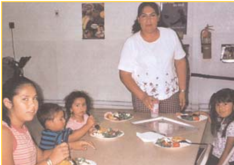
Southeast Arizona Food Bank

Toward distribution of food, baby supplies, and other necessities to low-income families