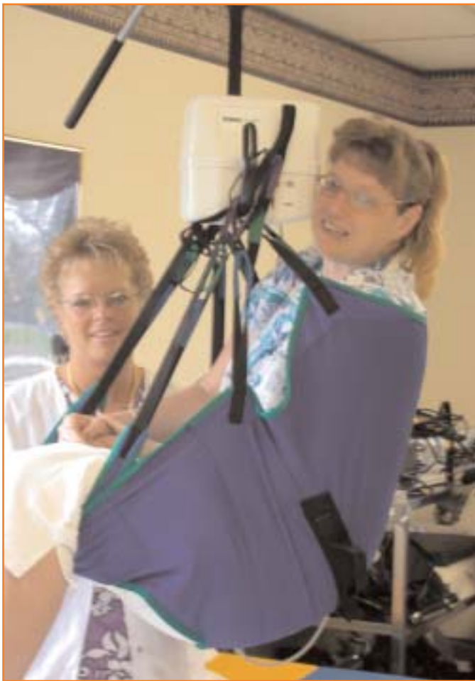
Echoing Hills Village Foundation

In 2002–2003, the Foundation funded 13 projects for a total of $210,632.