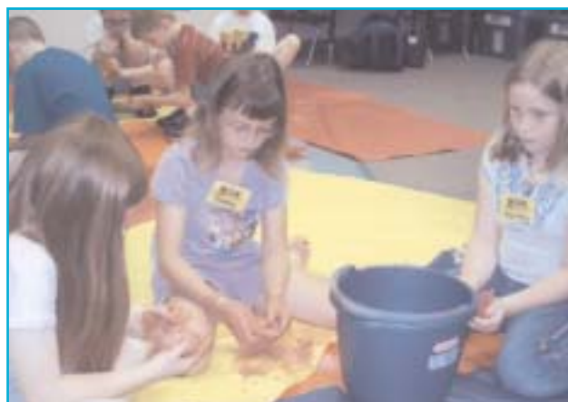
National Inventors Hall of Fame

Toward the promotion of pediatric literacy through the distribution of age-appropriate books to more than 22,000 children living in Greater Cleveland during sick-and-well-baby visits