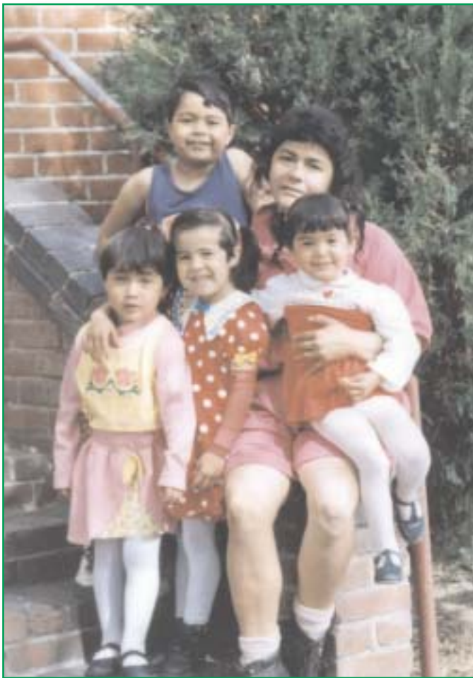
Barrett Foundation, Inc.

In 2002–2003, the Foundation funded 53 projects for a total of $534,603.