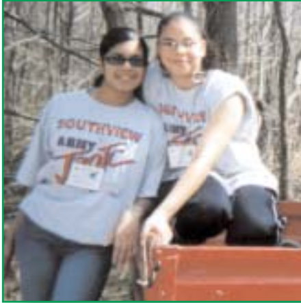
Volunteer Action Center