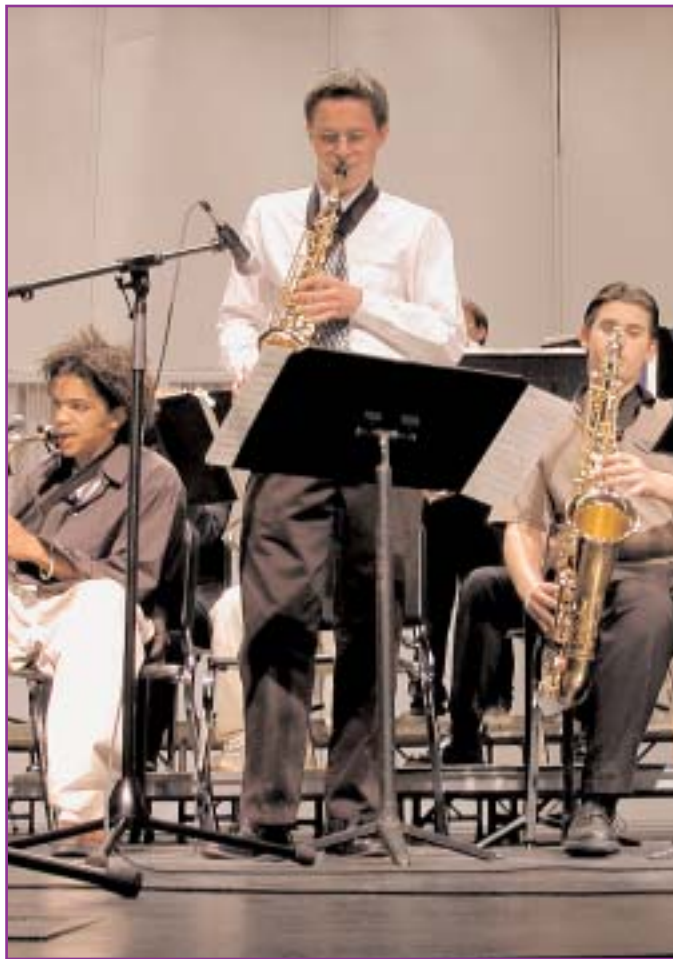
Tucson Jazz Society

In 2001–2002, the Foundation funded 31 projects for a total of $271,032.