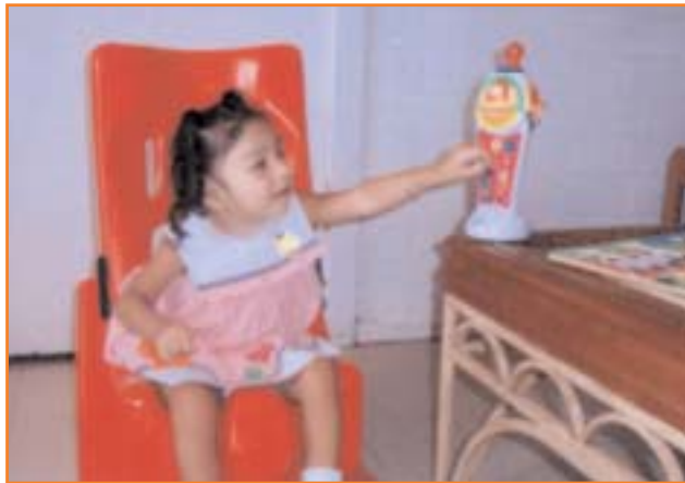
Easter Seals Arizona

Leukemia & Lymphoma Society, Desert Mountain States Chapter $2,000