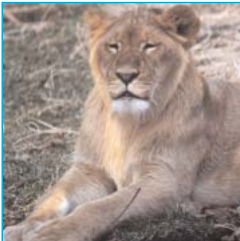
Cleveland Zoological Society

To support Camp Invention , a hands-on science summer camp offered in multiple locations throughout Lorain County