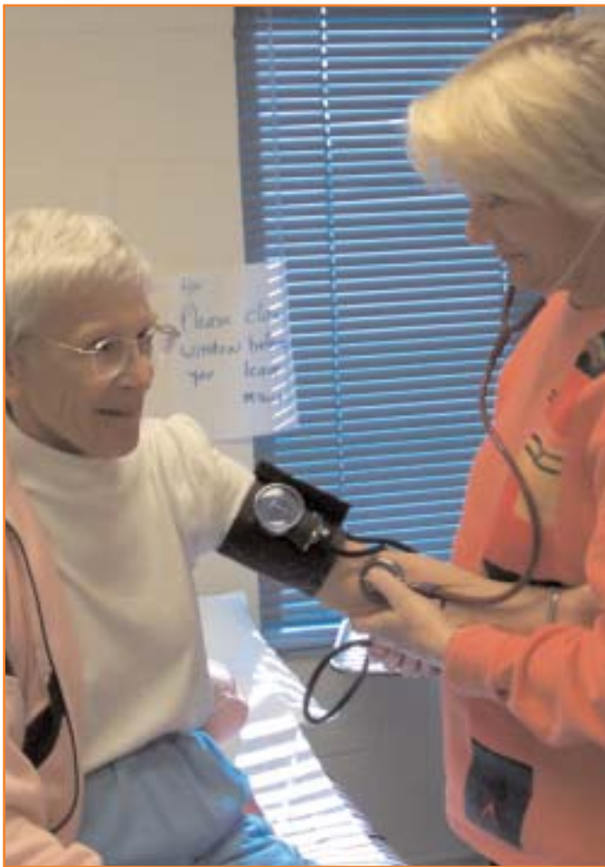
St. Luke's Healthcare Clinic

In 2001–2002, the Foundation funded 14 projects for a total of $190,210.