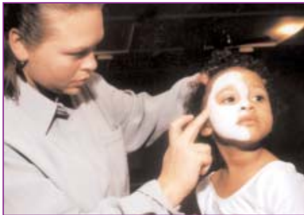
Messengers of God