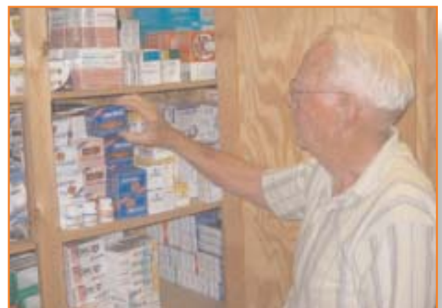
Lorain County Free Clinic

Toward computer upgrades allowing for better connectivity and communication among the Center's health clinics in rural Pima County