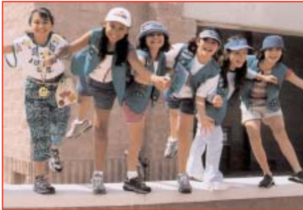
Sahuaro Girl Scout Council, Inc.