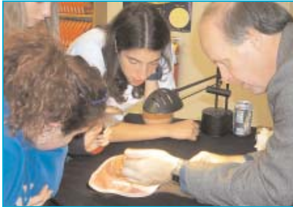
Lake Erie Nature and Science Center