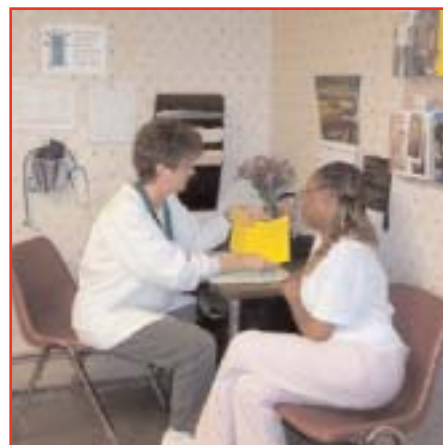
Family Planning Services of Lorain County

Continued support of It's Time to Talk , a youth diversity and inclusiveness program for high school students