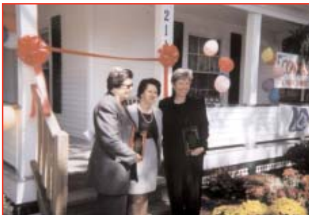
Compass House, Inc.

To provide increased outreach, recreational activities and leadership opportunities to school-aged girls throughout southern Arizona