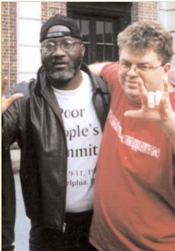
Deaf and Deaf-Blind Committee on Human Rights

In 2001–2002, the Foundation funded 19 projects for a total of $178,868.