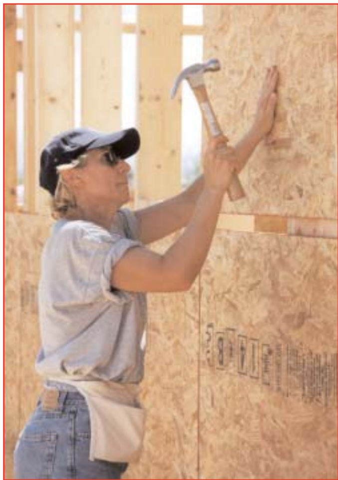
Habitat for Humanity Tucson

In 2001–2002, the Foundation funded 11 projects for a total of $153,090.