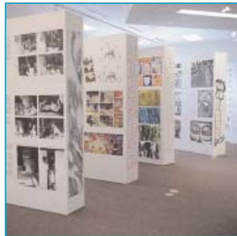
Hundred Languages of Children Reggio Emilia Exhibit (Northern Ohio Taskforce)

To support the Parent Leadership Institute, a multi-session training to increase parents' knowledge of and involvement in their children's schools