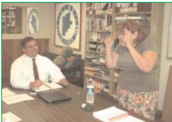
Cleveland Hearing & Speech Center

Boys & Girls Club of Lorain County $10,000 Lorain County, Ohio To develop a Cadet Enrichment Program , providing specialized after-school recreation, tutoring, prevention education, and conflict resolution programs for area children 6–9 years old