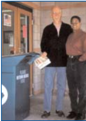
City of Bisbee, Copper Queen Library

As an initial approach, The Stocker Foundation appreciates the opportunity to discuss proposal ideas and to answer questions prior to any grant submission. Although guidelines are available for download at www.stockerfoundation.org , initial contact with staff is still preferred.