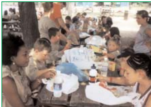
Lorain United Methodist Ministries (Camp I.D.E.A.S.)

Toward Project New Start , which provides counseling and treatment for teens addressing dual issues of sexual and substance abuse